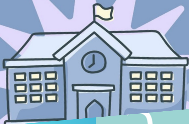
PHOTO RETAKE DAY!

MONDAY NOV. 20TH PROFESSIONAL DEVELOPEMENT DAY