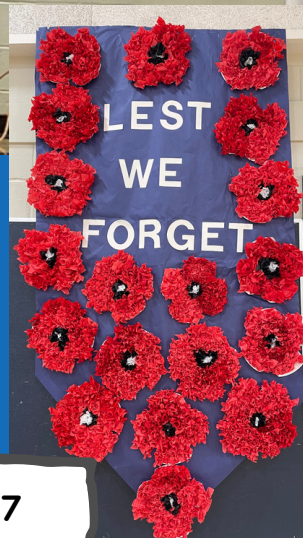
Peace Poems: DIV 7