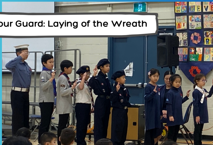
Colour Guard: Laying of the Wreath